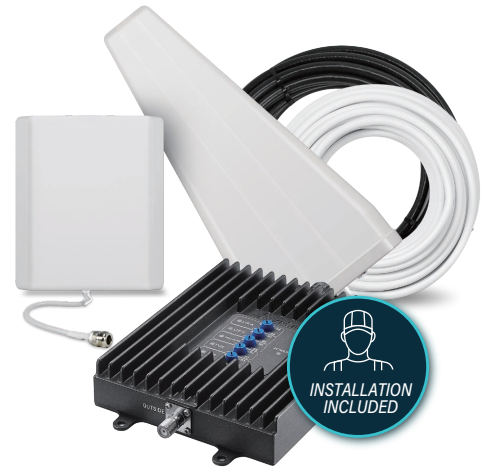
Shown: Fusion Install signal booster kit