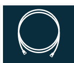
SC-240, 20 ft