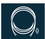
RG-11, 50 ft, optional adaptor