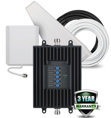
Shown: Fusion Professional signal booster kit