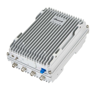
SignalMax Fiber DAS Cellular System for Large Enterprise Buildings